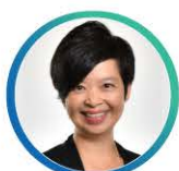
Hon Winnie HO, JP Secretary for Housing HKSAR Government